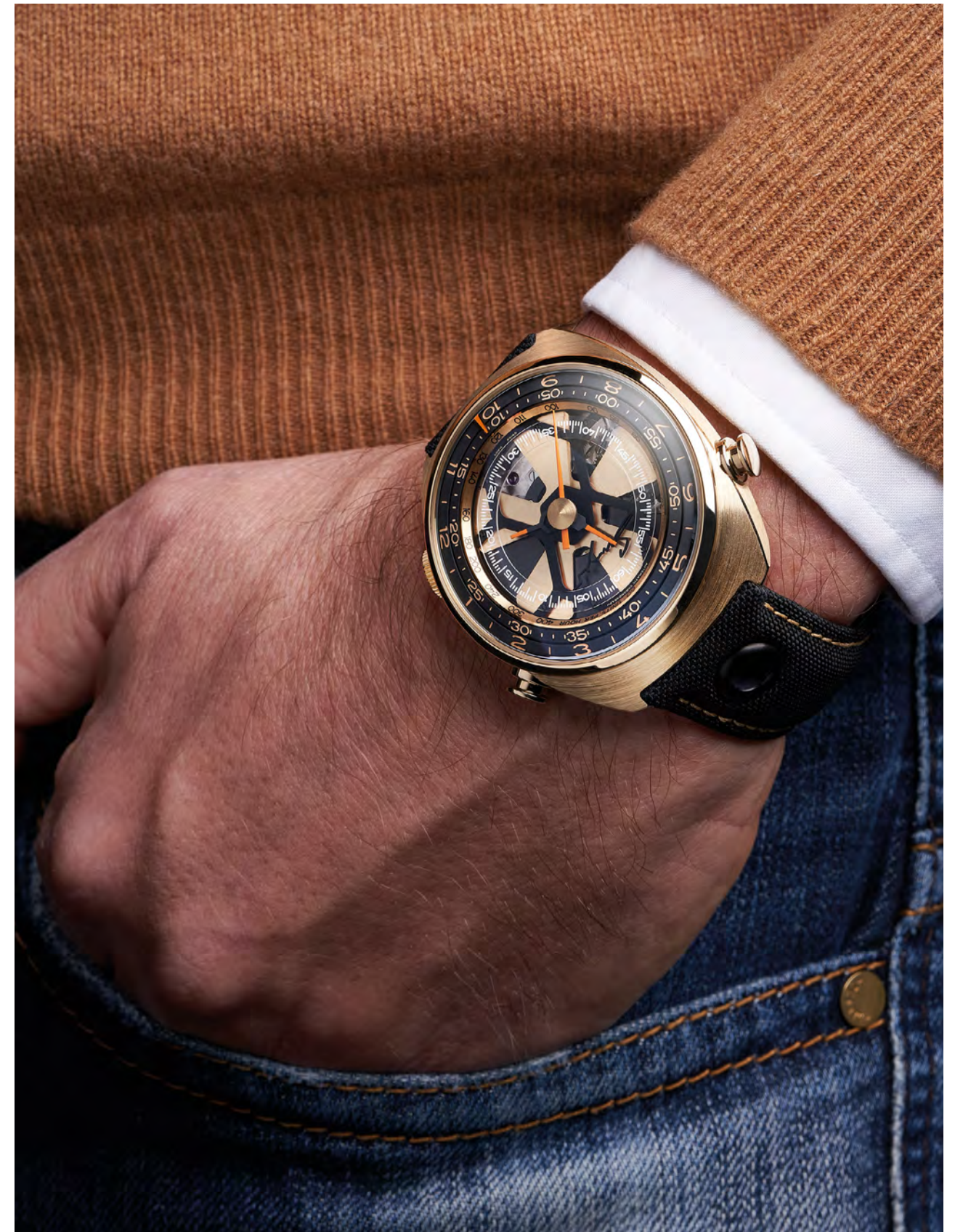
Track 1 Skeleton Gold Edition

Singer Reimagined's straps are manufactured with the same care and attention that Singer Vehicle Design lavishes on the interiors of clients' cars. With their distinctive square tip, the straps are crafted from rare and fine quality materials by expert artisans.